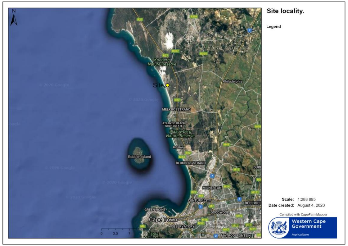
Figure 1: Locality of Koeberg Nuclear Power Station (site).

• Cape Farm Duynefontein No 1552, portion 0