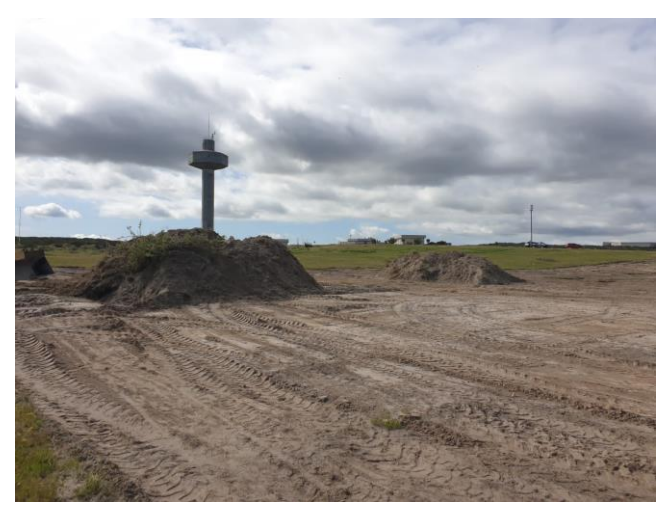
Image 4: Top layer of area to be cleared for car park extension stripped and stockpiled.