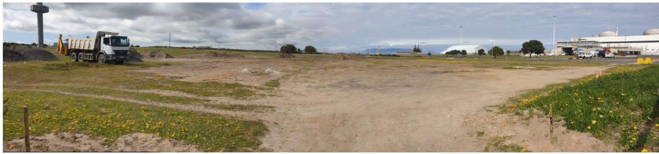
Image 10: Panoramic view of the area to be cleared in part of the KNPS car park expansion.