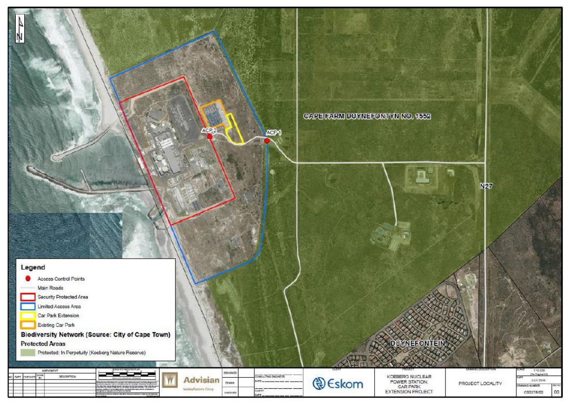
Figure 2: Site locality within Koeberg Nuclear Power Station.